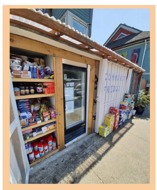
Don't forget to bring in your donations for the Community Fridge!