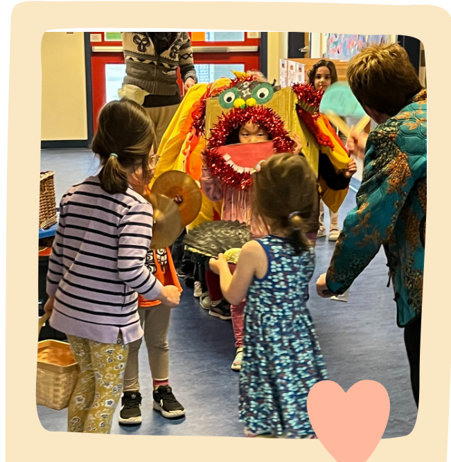
Happy Lunar New Year, from the Eagle Classroom!