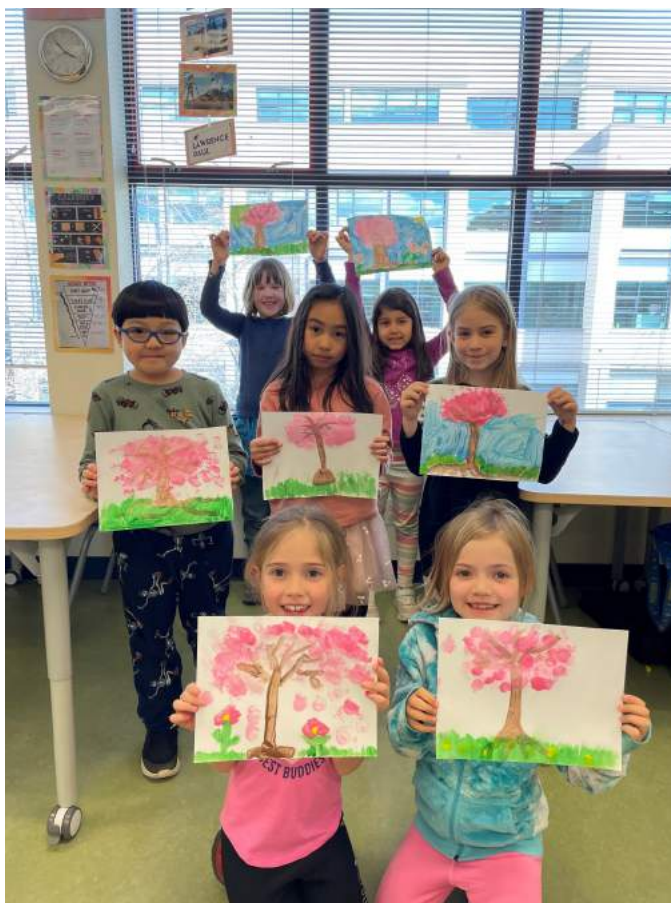
Celebrating the spring blossoms in after school care.